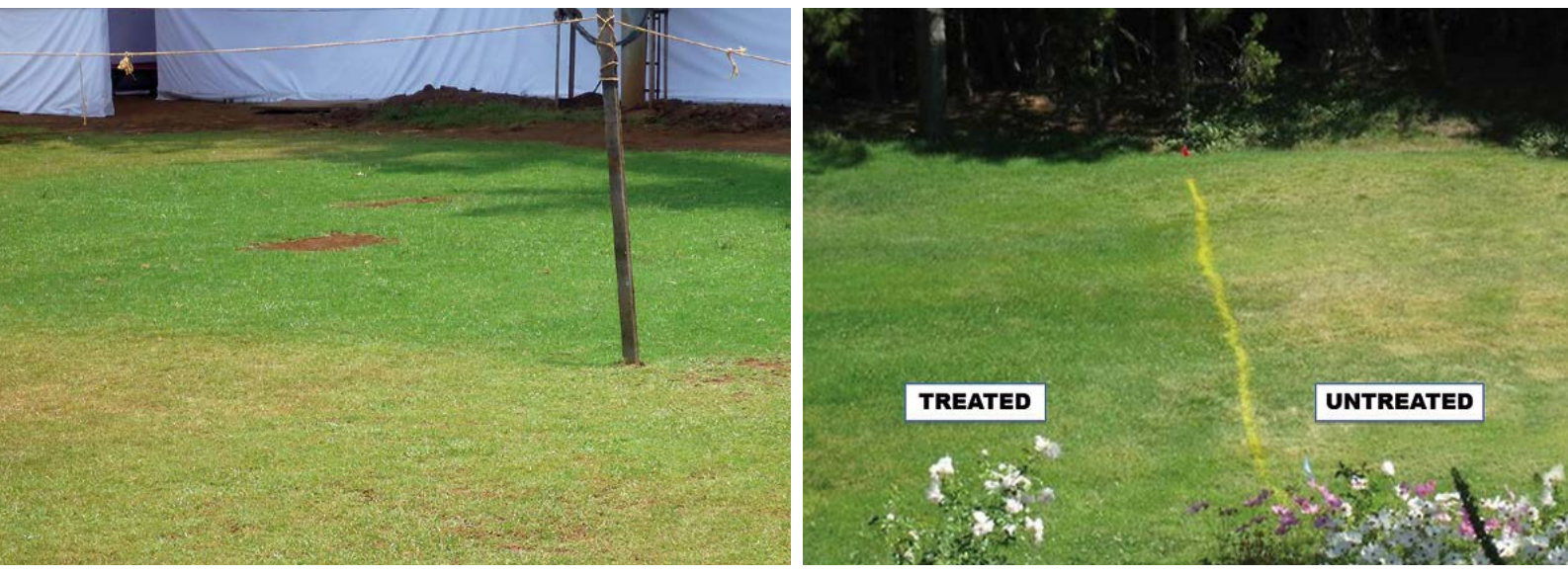
Sports field under water restrictions. Plot treated with a hygroscopec humectant.

polyacrylamide polymers used in the field will absorb and hold 80 to 200 times their weight in water or more. Their ability to hold soil water is influenced by the amount of polymer in the soil, the type of polymer utilized and soil characteristics, such as salt content ( Polhemus , 1992). As the concentration of ions increases in water, the amount of hydration by the polymer decreases ( Orzolek , 1993). The lifespan of polymers is thought to range from 2 to 10 years, depending on the type of polymer and soil conditions ( Polhemus , 1992).