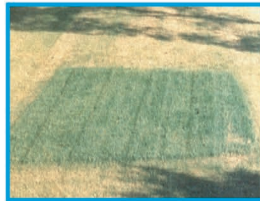
The difference is clear...