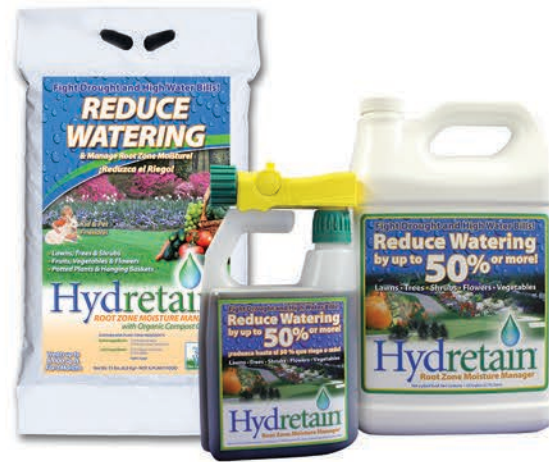
Hydretain is available in a variety of sizes in both liquid and granular forms to suit your needs.